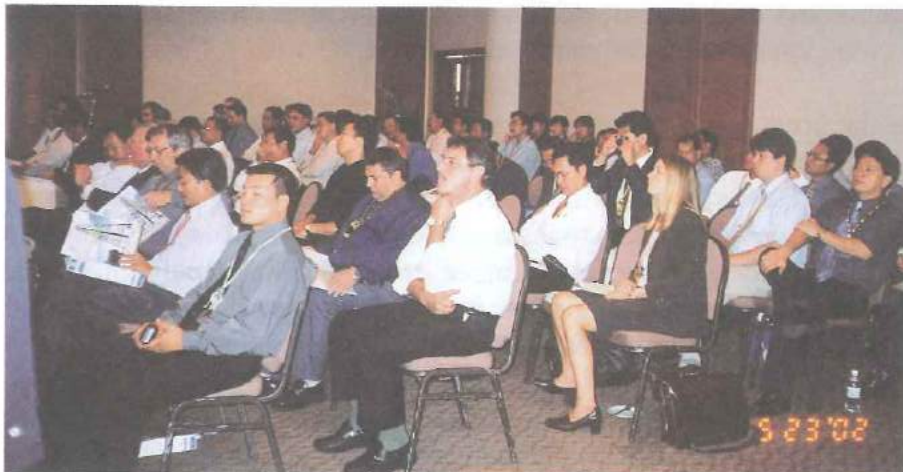
Conference Participants and Delegates