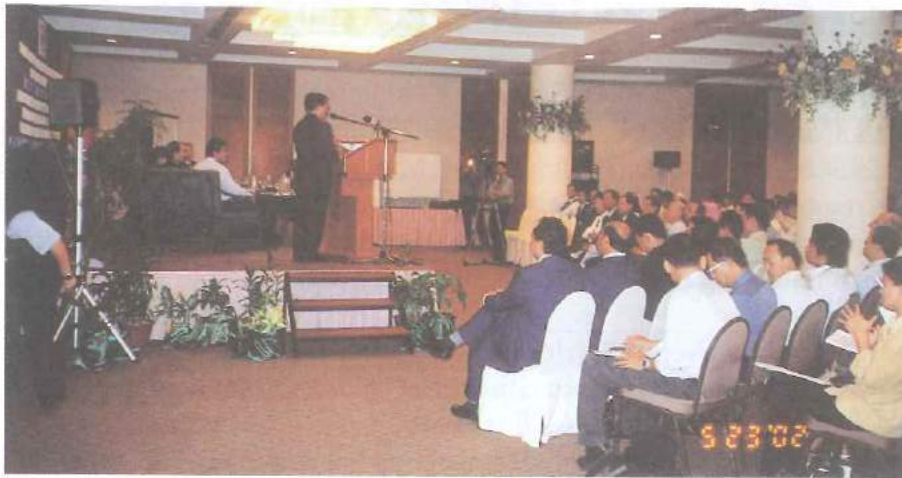
Participants during the IMM Conference