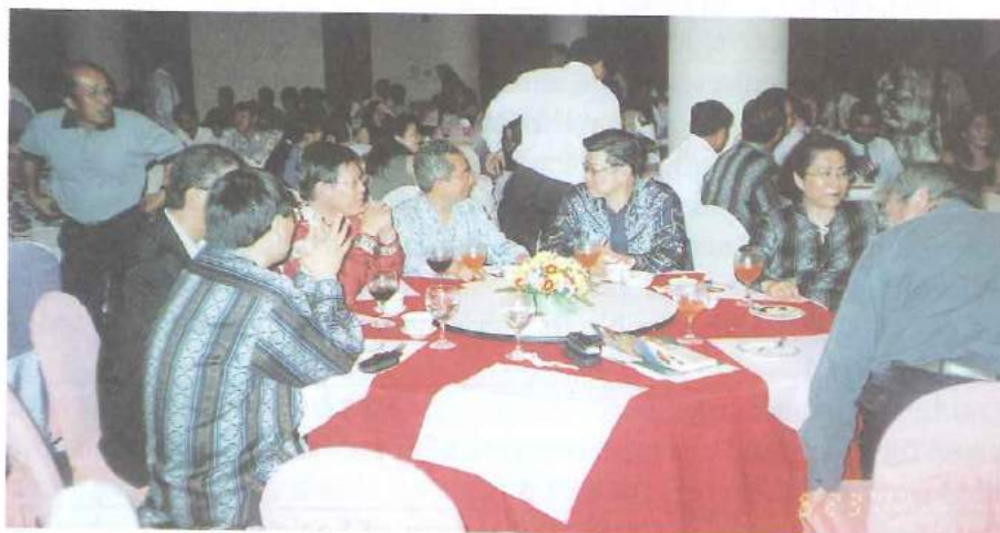
Exhibitors, Participants, VIP and IMM Officials during the Conference Banquets Dinner