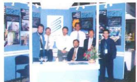
Group photo of Organizing Committee and one of the exhibitors.

IMM would like to thank to Malaysian Airline Systems (MAS), IMTCE 2004 Official Airline ; JEOL, Silver Sponsor ; Inter Merger Sdn Bhd, Opening Ceremony Lunch Sponsor and OGP Technical Services Sdn Bhd, Golf Tournament Sponsor for their kindness for being the sponsors.