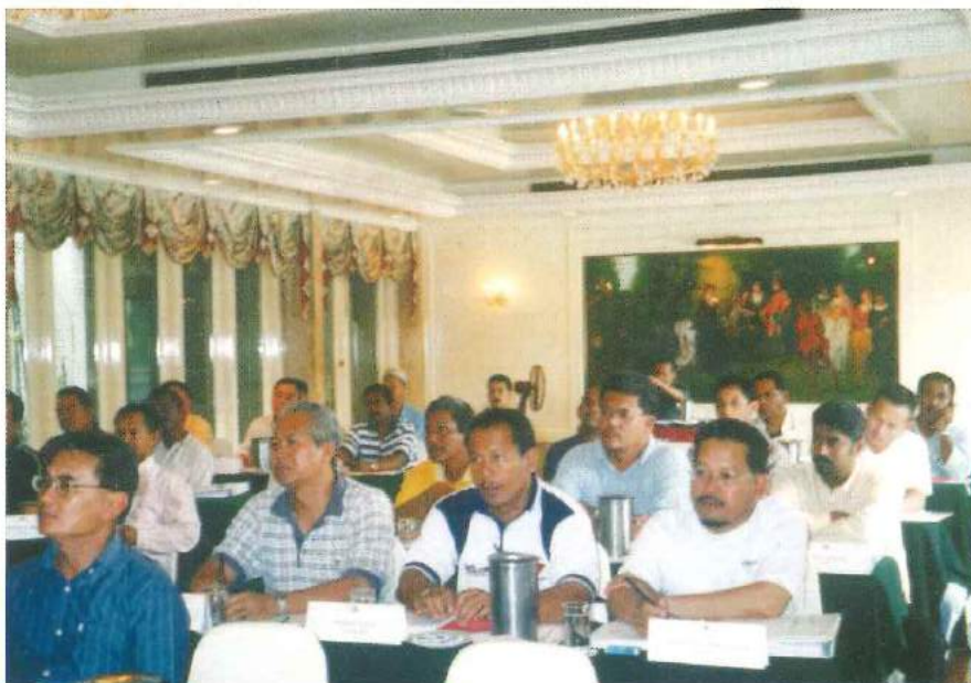
Participants listening to the lecture and presentation by the speaker.