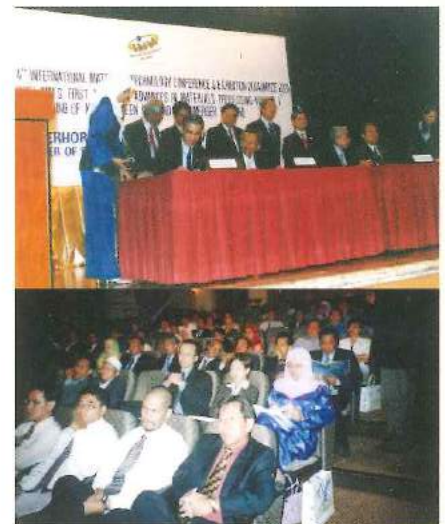
Signing ceremony witnessed by Datuk Seri Law Hieng Ding and some of the guests.