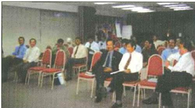
Some of the guests during the presentation

In Malaysia, the Institute of Materials, Malaysia (IMM), through its Welding Committee, will co-ordinate the iMOS and will need the backing of the Oil & Gas Operators and Government agencies, too. The IMM has identified Petronas Carigali Sdn. Bhd., Sarawak Shell Berhad, ExxonMobil Exploration & Production (M) Inc, SIRIM, CIDB, and DOSH to collectively support the implementation of iMOS in Malaysia.