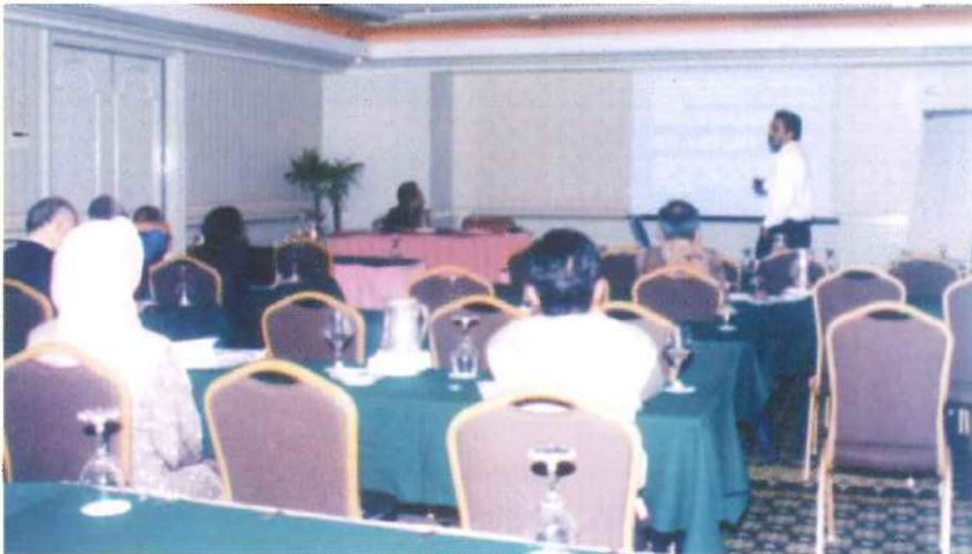
Speaker presenting in one of the symposiums.

4 th International Materials Technology Conference and Exhibition 2004 (IMTCE 2004) was held on 23 rd – 25 th March 2004 at Hotel Istana, Kuala Lumpur, Malaysia. "Initiatives and Innovations in Materials for Sustainable Development" was chosen as this year's theme. The conference comprises four symposia which were Advances in Plastics and Rubber Technology, Corrosion Management, Metallurgy and Welding Technology and Advanced Materials and Composites.