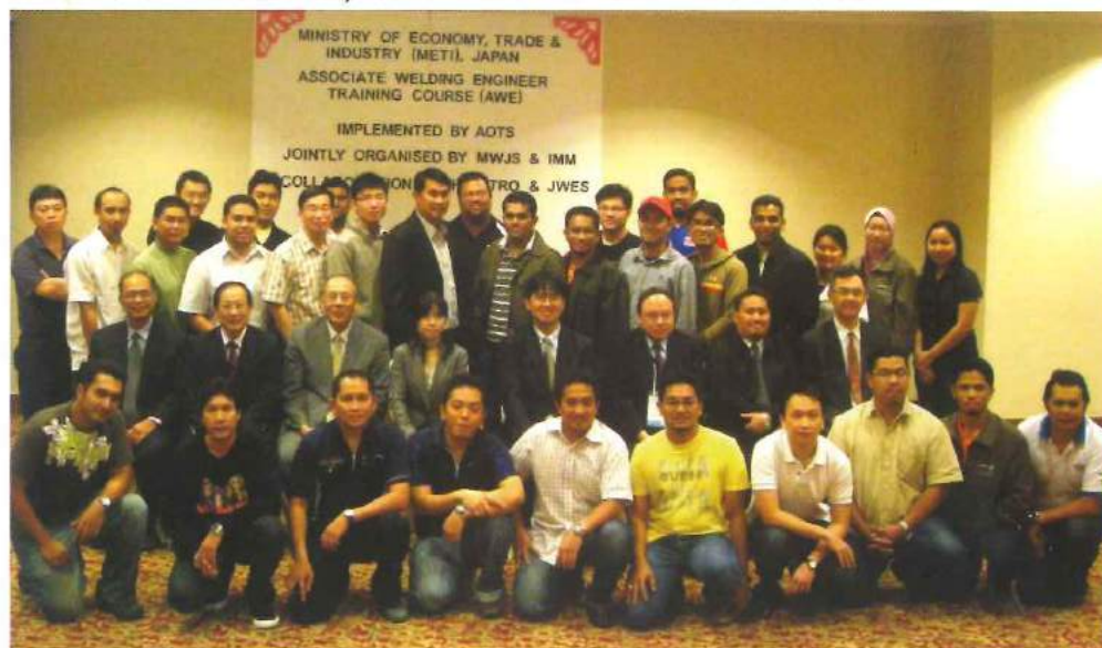
The pioneer group of AWE participants

T he welding community especially in the Oil & Gas, marine and ship-building sectors in Malaysia received a huge boost recently when the Associate Welding Engineer (AWE) training course under the Japan Welding Engineering Society (JWES) Welding Coordination Personnel Scheme was conducted in Kuala Lumpur for the first time from 17 th to 24 th