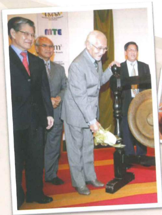
The Chief Minister of Sarawak, YAB Pehin Sri Haji Abdul Taib, at the opening ceremony of IMTCE2010