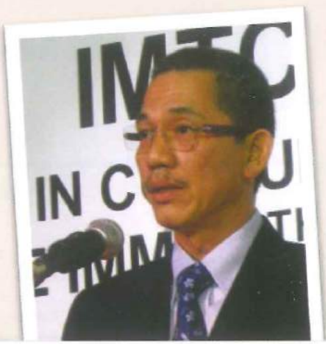
Right: IMTCE2008 Guest of Honour - YB Tuan Fadillah Yusof (Dep Minister, MOSTI); Below: IMM celebrates 20th Anniversary