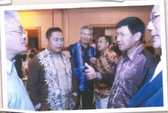
Top: Networking at IMTCE2010;