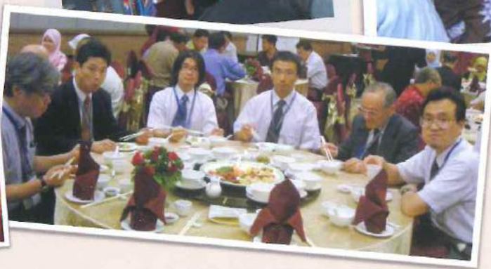
Left: Delegates enjoying banquet dinner