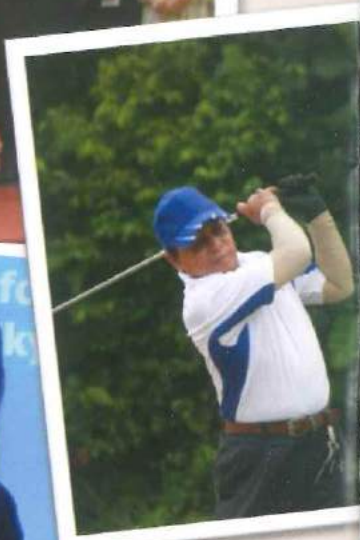
Top: Swinging into IMTCE2010