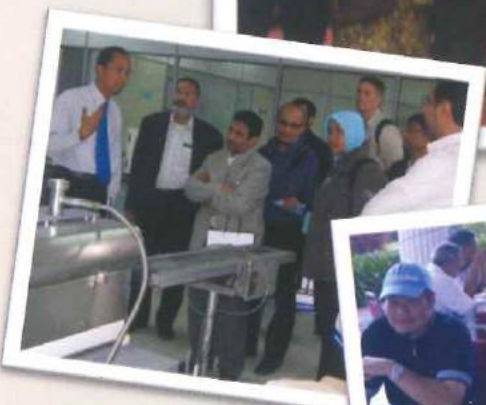
Far right: Oral presentation; Top: technical visit; Right: Waiting to tee-off