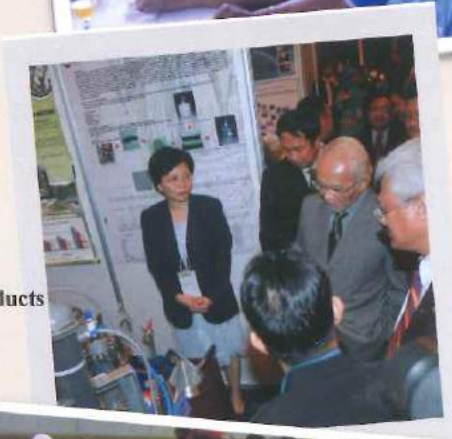
R: Exhibitor explaining products