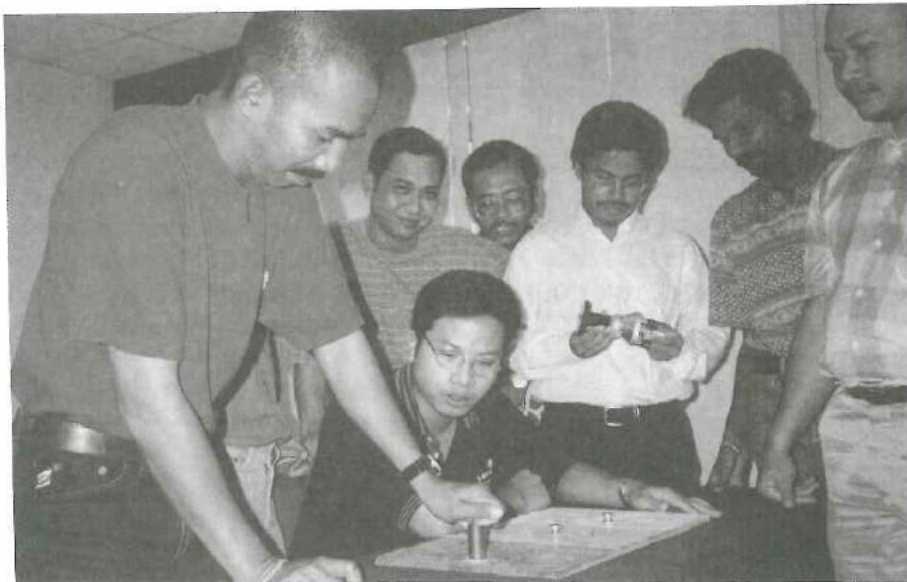
PARTICIPANTS OF THE IMM – COATINGS INSPECTOR COURSE AT HOTEL SELESA, PASIR GUDANG

IMM Southern Region Committee has also organised a social activity namely, a Bowling Tournament for members and UTM students. The Tournament which was held on 4 August 1999 at Pemas Jaya, Johor Bahru also received good response from about 50 enthusiastic participants.